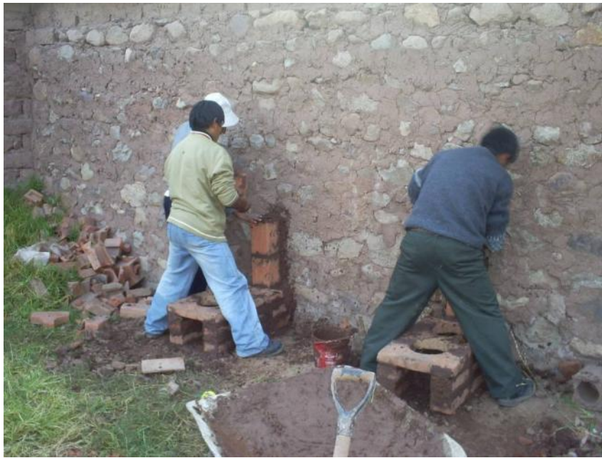
30. Training campaigns to technical experts for installing improved stoves in Cusco.