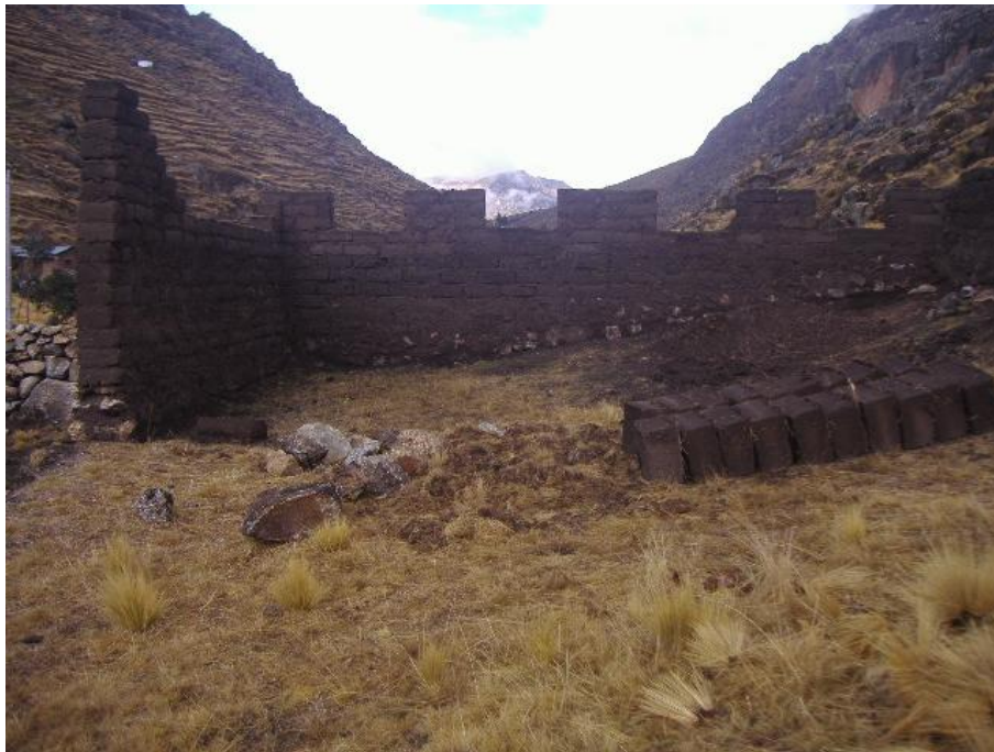
20. Shed construction in the peasant community of the district of Coaza, Carabaya