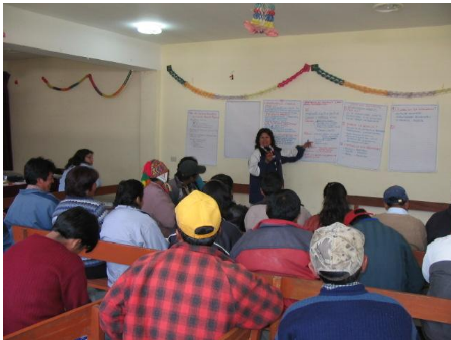
12. Participants at the Training Program for the staff of the Health Center in Marcapata.