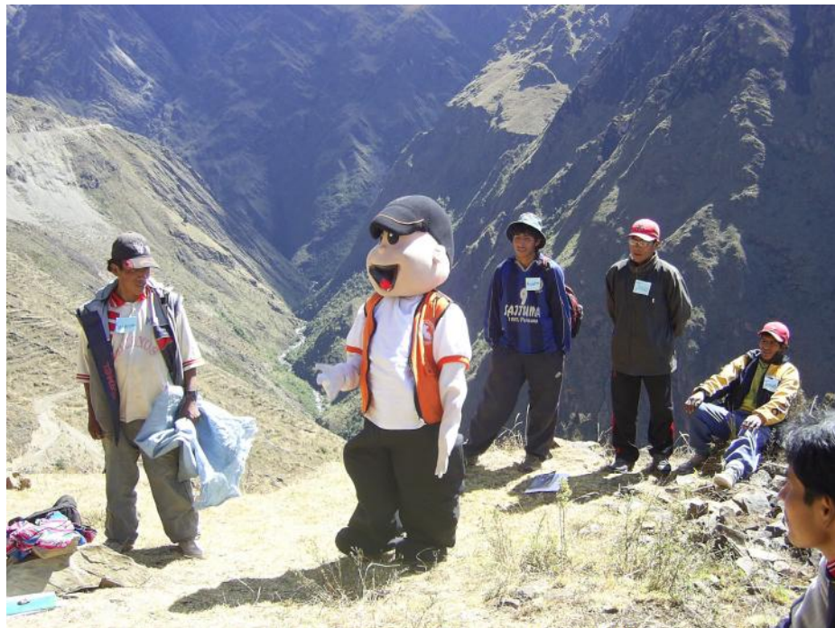
10. Young leaders participating in the Disasters Management Squad Training in the community of Phusca – District of Usicayos – Carabaya.