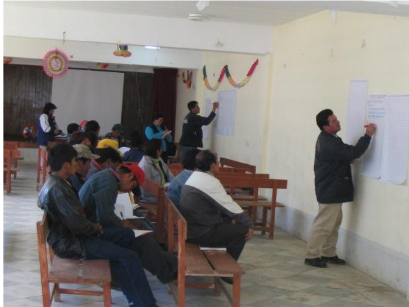
13. Head of the Health Center of Marcapata, explaining the health experts what to do in an emergency case.