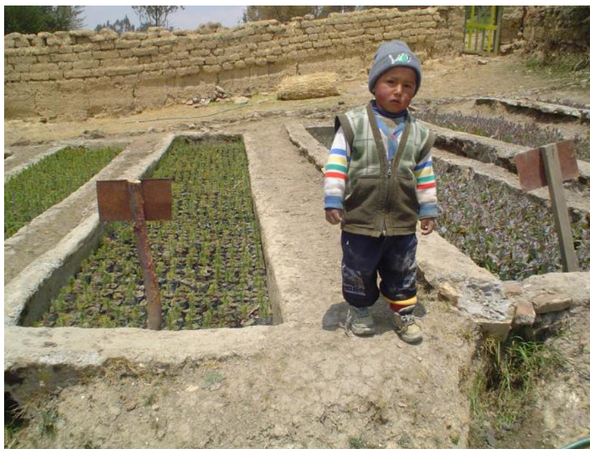
15. Greenhouse in Ccatca with seedlings of Pine, Eucalyptus, Chachacomo and Queñua

United Nations Systems in Peru United Nations Emergency technical team