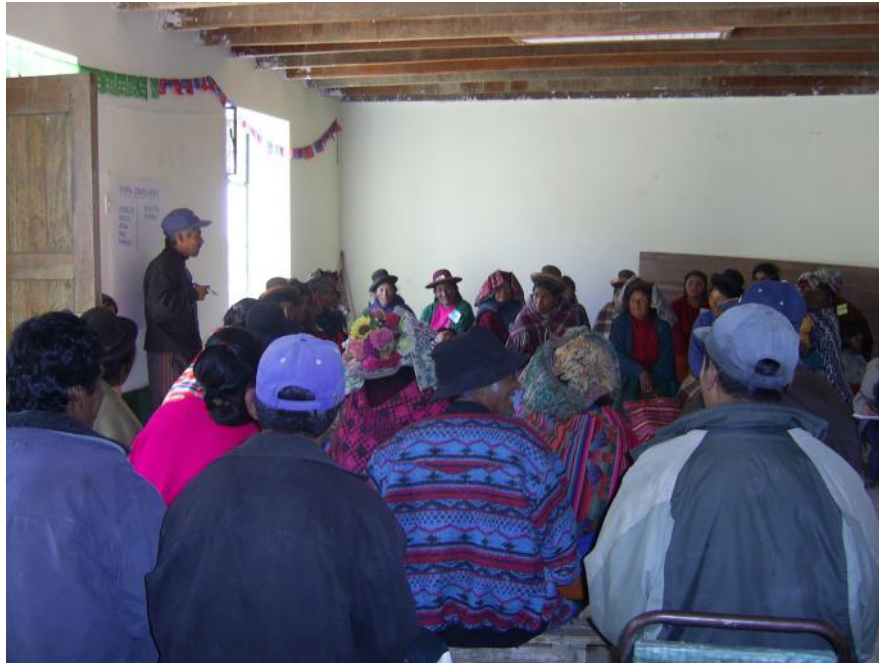
5. Training workshop directed to authorities of the District Comité for Disasters Management -CDDC in Usicayos, Province of Carabaya

United Nations Systems in Peru United Nations Emergency technical team