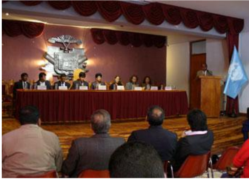
1. UNETE team at the presentation of the Disaster Prevention Project in Urcos, capital of the Province of Quispicanchi – Cusco

United Nations Systems in Peru United Nations Emergency technical team