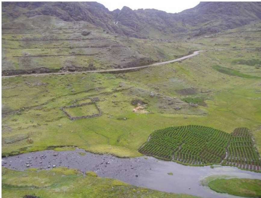
26. Terraces of slow growing and potato crops in the peasant community of Escalera, district of Usicayos, Province of Quispicanchi