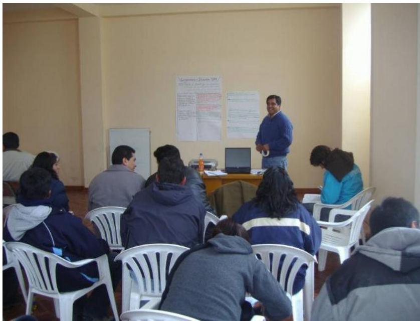
14. Appraisal and planning meeting with the health and education office representatives in Macusani, capital of Carabaya.