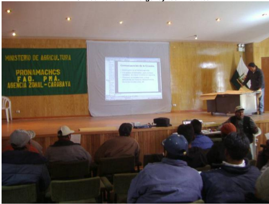
19. Training Course in soil conservation practices and sheds constructin through the methodology of the Escuelas de Campo (ECAS) carried out in Macusani, Carabaya

United Nations Systems in Peru United Nations Emergency technical team