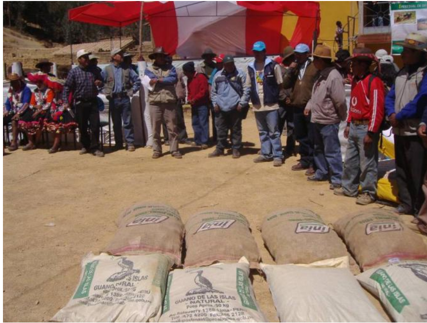
23. Handing over certified potato seeds and organic humus to the communities of the district of Ocongate, Quispicanchi