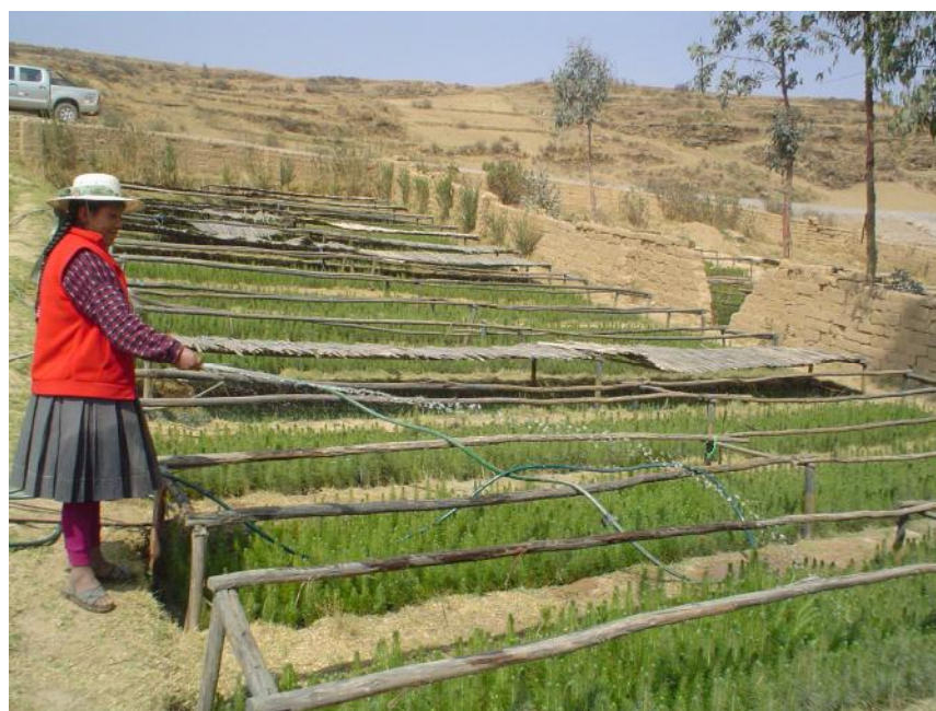
16. Member of the conservation committee of Ccatca. Carrying out his catering ruties at the greenhouse.