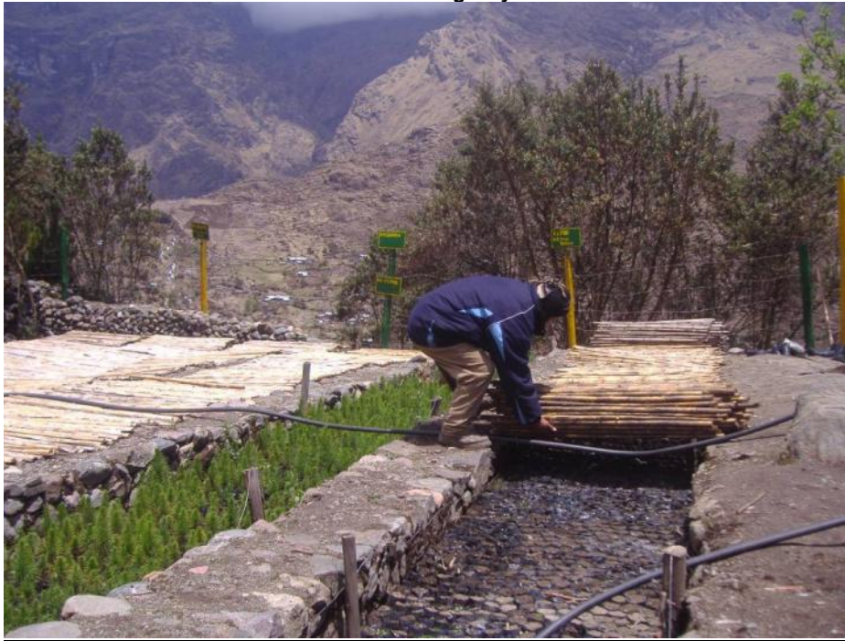
17. Agricultural community expert providing technical assistance at the greenhouse of the peasant community of Escalera, district of Ayapata, Carabaya

United Nations Systems in Peru United Nations Emergency technical team