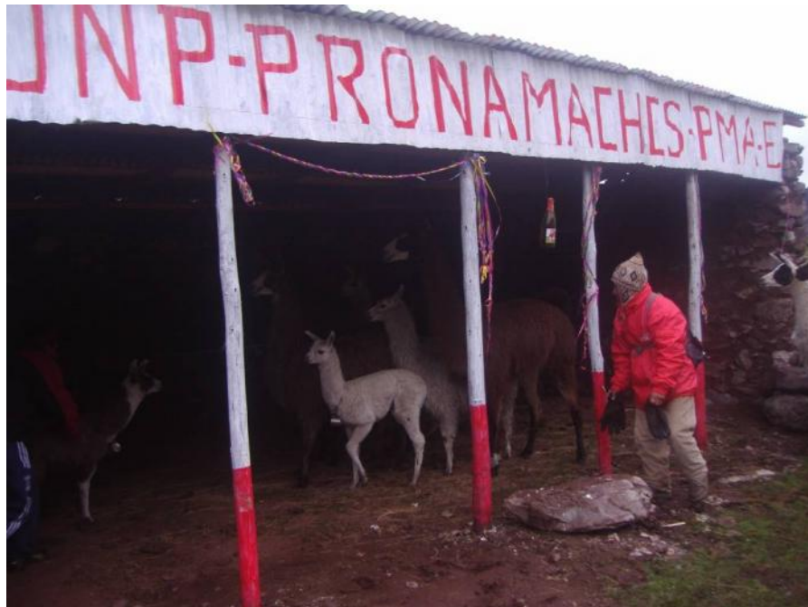
22. Opening of a shed in the district of Ayapata