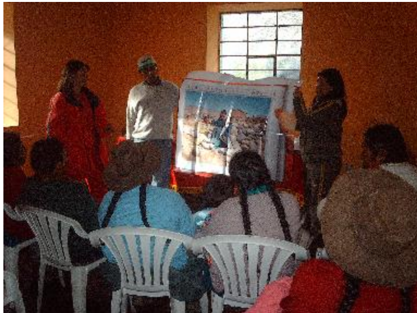
28. Health promoting campaigns.