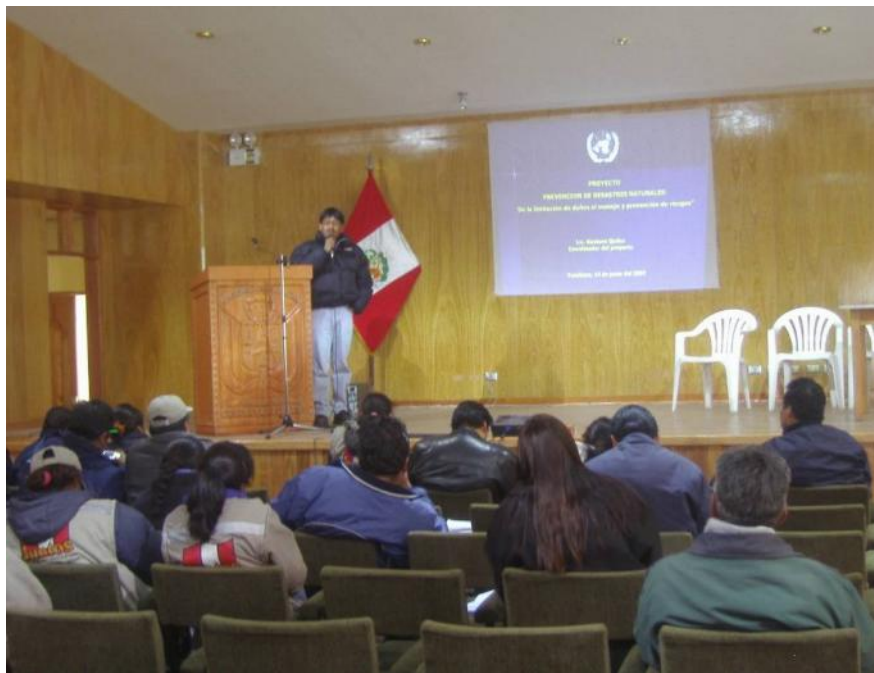
2. Presentation of the project in the city of Macusani, Province of Carabaya - Puno