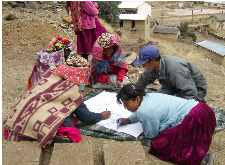
9. Participants of the Training Program for Authorities in the peasants community of Coyorana – District of Usicayos – Carabaya, working on their plan for Disasters Management at a community level.

United Nations Systems in Peru United Nations Emergency technical team