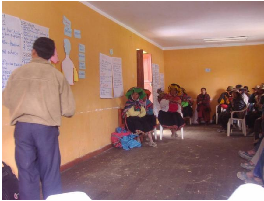
11. Involvement talk to mothers and authorities about the benefits of implementing and using of the Waiting Houses, district of Carhuayo, Province of Quispicanchi.