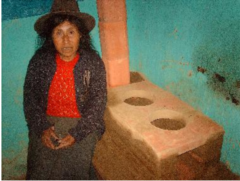
31. Improved store model installed in the district of Carhuayo, province of Quispicanchi.

United Nations Systems in Peru United Nations Emergency technical team