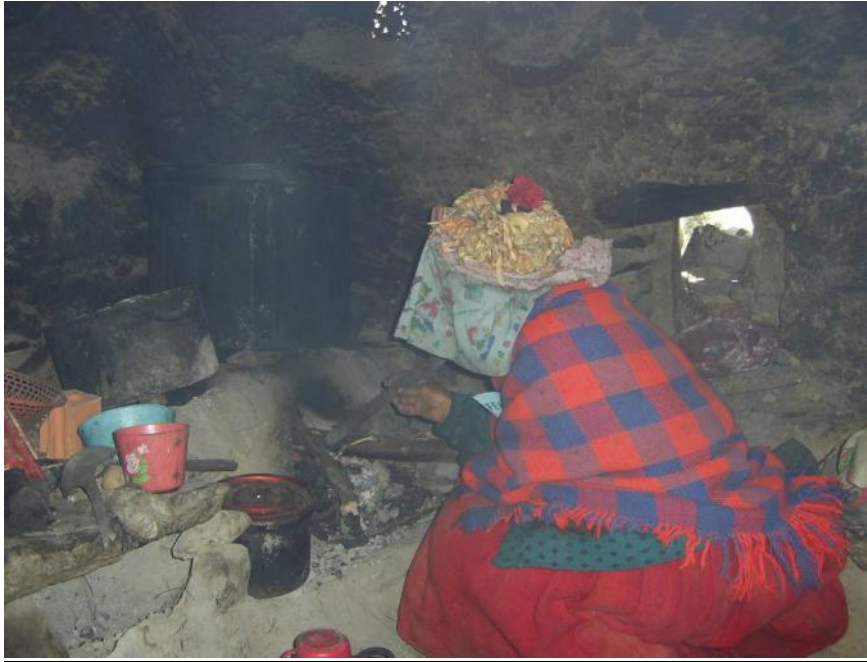
27. Situation appraisal of the kitchen (stoves) conditions of the households in the communities of Carabaya y Quispicanchi

United Nations Systems in Peru United Nations Emergency technical team