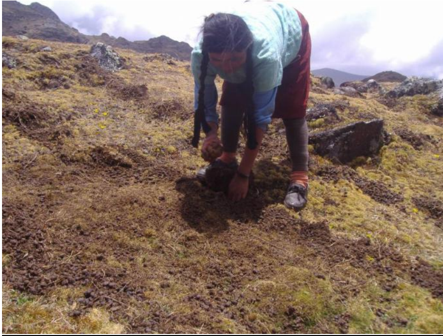
25. Potato crop fittings with certified seeds in the community of Taype, distrito de Ayapata, province of Carabaya.

United Nations Systems in Peru United Nations Emergency technical team