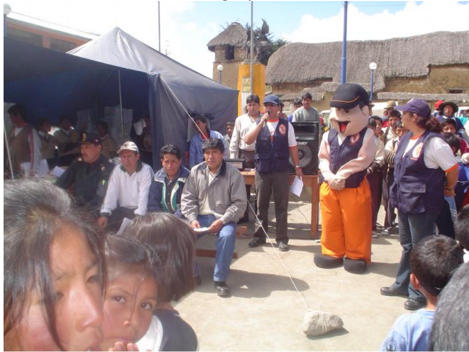
7. Involvement campaigns through an “Informative Fair” in Marcapata, with the participation of the district authorities, “representatives of the Peruvian National Police, the school principal, the governor and the district mayor.

United Nations Systems in Peru United Nations Emergency technical team