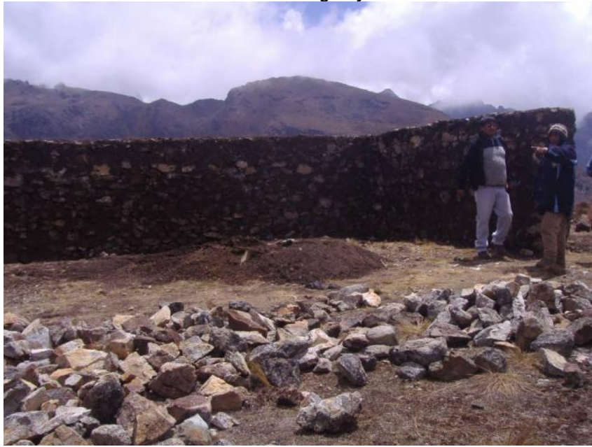
21. The process of constructing a shed in the peasant community of, district of Ayapata, Carabaya

United Nations Systems in Peru United Nations Emergency technical team