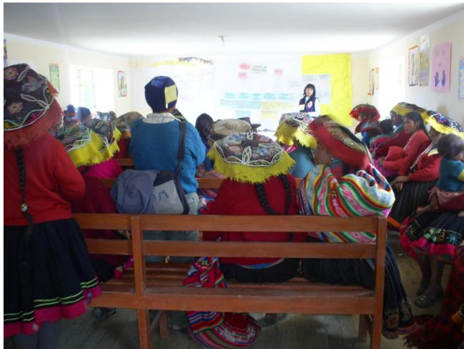
8. Disasters Management Squad training in Ccopi – district of Ccatca – Quispicanchi.