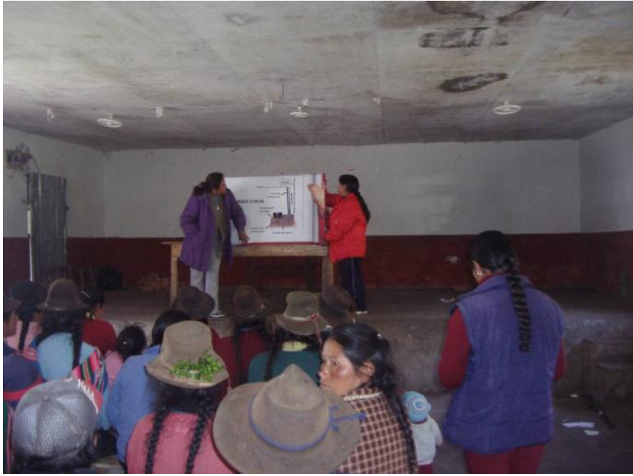
29. Training mothers on health promotion and installation of improved stoves in the community of Taype, district of Ayapata, Carabaya

United Nations Systems in Peru United Nations Emergency technical team