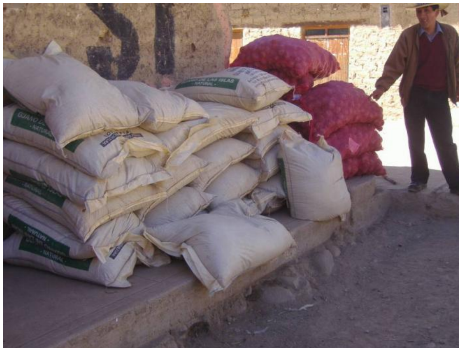
24. Receiving certified potato seeds and organic humus for the communities of the district Carhuayo, Province of Quispicanchi.