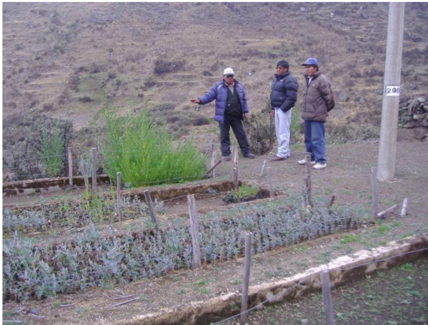
18. Supervising the greenhouse set up in the community of Upina, district of Ituata, province of Carabaya.