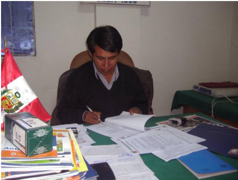
6. Mayor of Corani, province of Carabaya signing the Resolution of Recognition of the District Committee and Community Committee for Disasters Management.