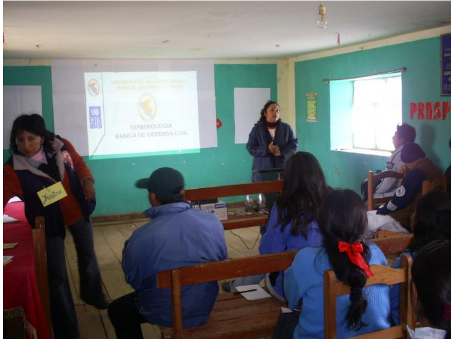
3. Training of main authorities in Sauri, Ccatca, Province of Quispicanchi

United Nations Systems in Peru United Nations Emergency technical team